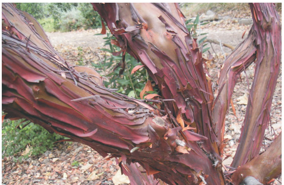
Arctostaphylos refugioensis with beautiful rich colored bark.