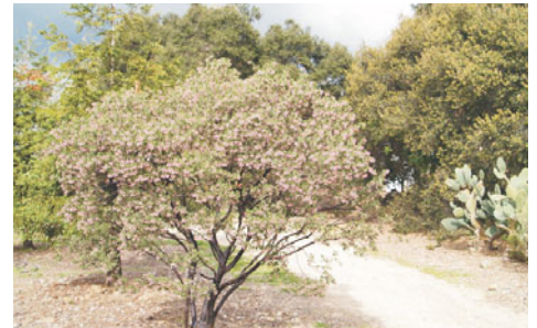
Arctostaphylos 'Louis Edmunds'

In formal applications, Manzanita makes an excellent foundation plant, one which should be used much more frequently in landscapes throughout the state.